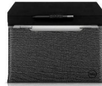
Dell Premier Sleeve - XPS 13