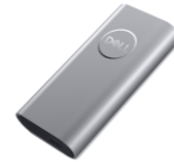
Dell Portable Thunderbolt™ 3 SSD, 500GB (SD1-T0500)(M)